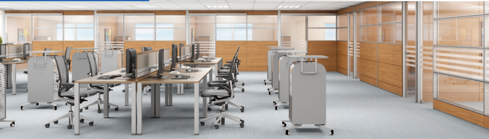
Banner Bank Building Boise, Idaho